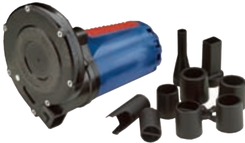
iD20 Inflator/Deflator with Adapters.