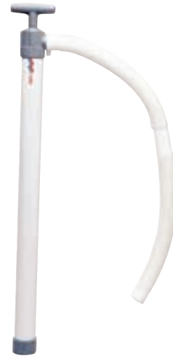
165 8 gpm (30 lpm) - with 24" (610mm) hose.

Constructed of sturdy ABS plastic with comfort-grip handle providing smooth firm strokes. Available in 24" (610mm) with hose and 48" (1220mm) with hose.